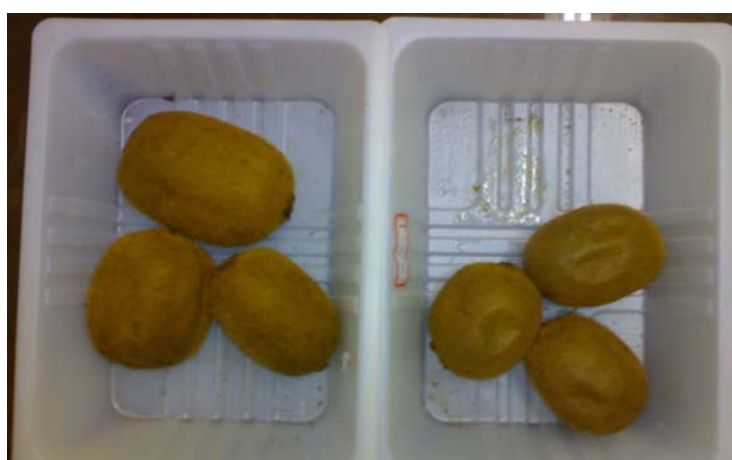
Figure 3. Coated kiwifruits (left) and uncoated samples (right) after 4 weeks

** Control (uncoated), (T1) 10 g WPC+ 3 g Gly + 0 g rice bran oil, (T2) 10g WPC+ 3 g Gly+0.2 g rice bran oil + 100ml distilled water, (T3) 10g WPC+ 3 g Gly +0.4 g rice bran oil +100 ml distilled water (4) 10g WPC + 3 g Gly +0.6 g rice bran oil +100 ml distilled water.